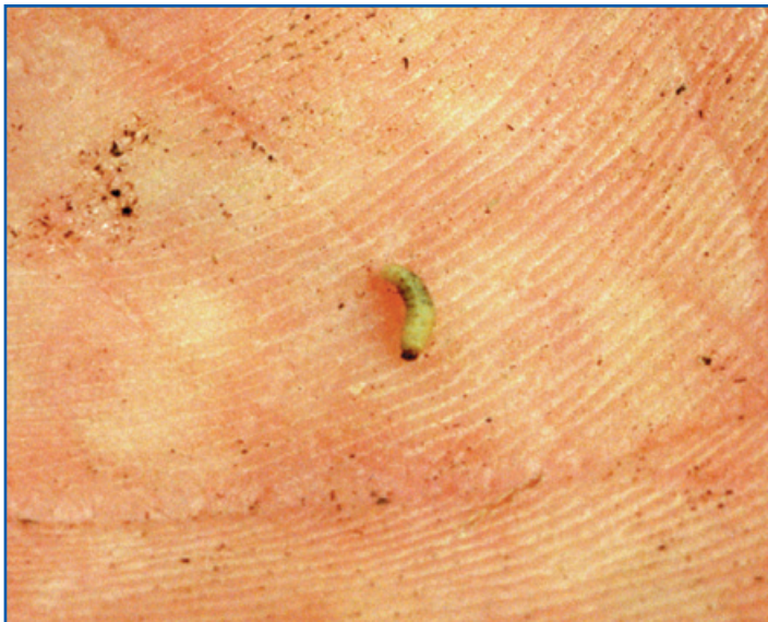
Photo 1: Larva of Argentine Stem Weevil showing discolouration due to infection from entomopathogenic nematodes.

The mature adult weevil is a grey/brown hard bodied insect around 3mm long. The female lays up to 300 eggs over a number of weeks. The eggs are laid in the grass leaf sheath from which the tiny maggot-like larvae hatch. The larvae tunnel and mine their way into the grass stems until they are too large for the stem diameter (this will depend on the grass species they are attacking). After this stage the larvae will drop out of the stems and move into the soil/thatch layer to feed on the roots. The larvae have a creamy white body with a tan coloured head (see Photo 1). They don't have legs (unlike the cockchafer group). They grow to around 5mm long before pupation.