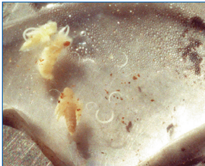
Photo 4: Large females ( Heterorhabditis zealandica ) found in larvae and pupae when they are cut open. These nematodes are 2 - 3 mm long.

Until this trial no work had been done on the control of Argentine Stem Weevils using EN products and our aim this summer was to determine their effectiveness on this important pest.