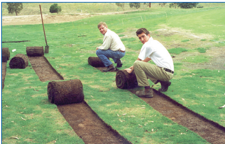
Photo 2: The site in front of the 5th Green, Tullamarine Country Club. The degree of damage can clearly be seen. The turf being rolled here was taken to the lab for intensive counting.

New Zealand is having success with two biological control agents, a parasitic wasp ( Microctonus hyperodae ) and a fungal pathogen ( Beauveria bassiana ). The status or potential of these agents in Australia is unknown.