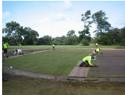
Greens turf laying

I have planned, managed and executed greens construction and establishment of cool season grasses from both seed and turf. At Royal Melbourne alongside the Course Superintendent I assisted in management of and implementation of the greens replacement program and irrigation upgrade of all greens and surrounds. This experience has then helped me successfully manage the current greens replacement program at Woodlands Golf Club to replace the old bentgrass and Poa greens with Mackenzie creeping bentgrass. In my three years at Woodlands we have replaced twelve greens and surrounds. Four greens are being replaced per growing season and are being re-introduced back in to play after three months.