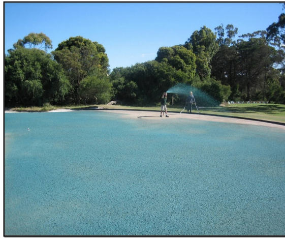
Greens establishment hydro-seed mulch