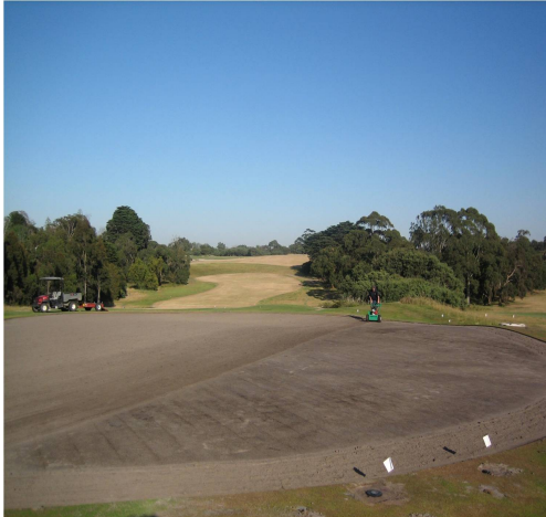
Greens surface preparation