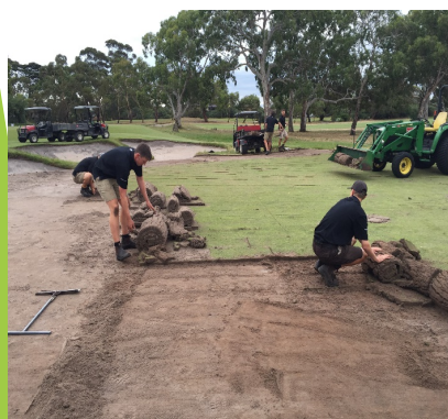
Organic matter removal